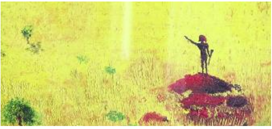
DETAIL FROM 'DAVID'S JOB' (ABOVE) AND 'DAVID'S DREAM' (BELOW).